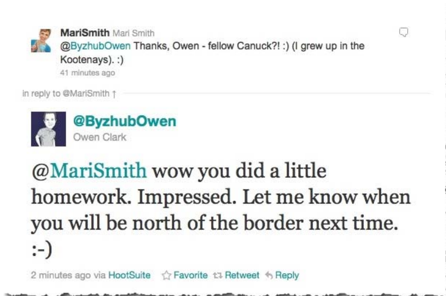
Figure 2.2 Owen's tweet back to me