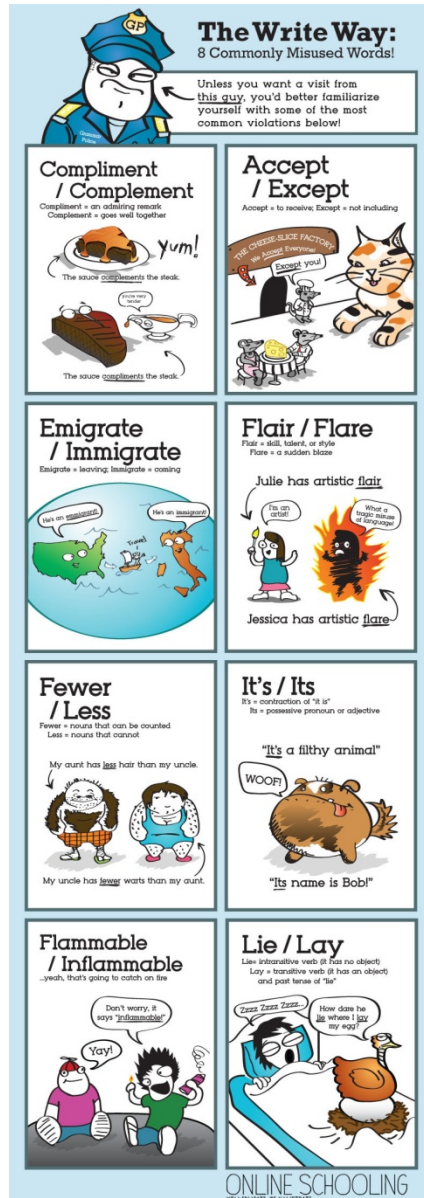
Figure 2.4 Eight commonly misused words

Compliment/complement Accept/except Emigrate/immigrate Flair/flare Fewer/less It's/its Flammable/inflammable Lie/lay